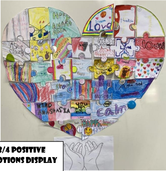
3/4 POSITIVE EMOTIONS DISPLAY